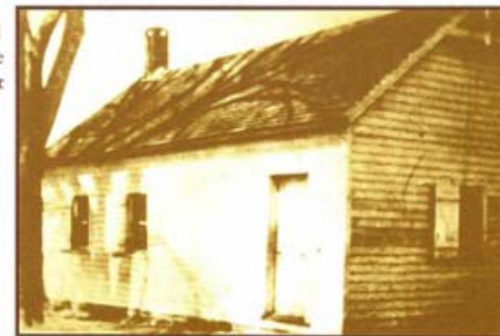
Good Road School House located near the Fitch family home.