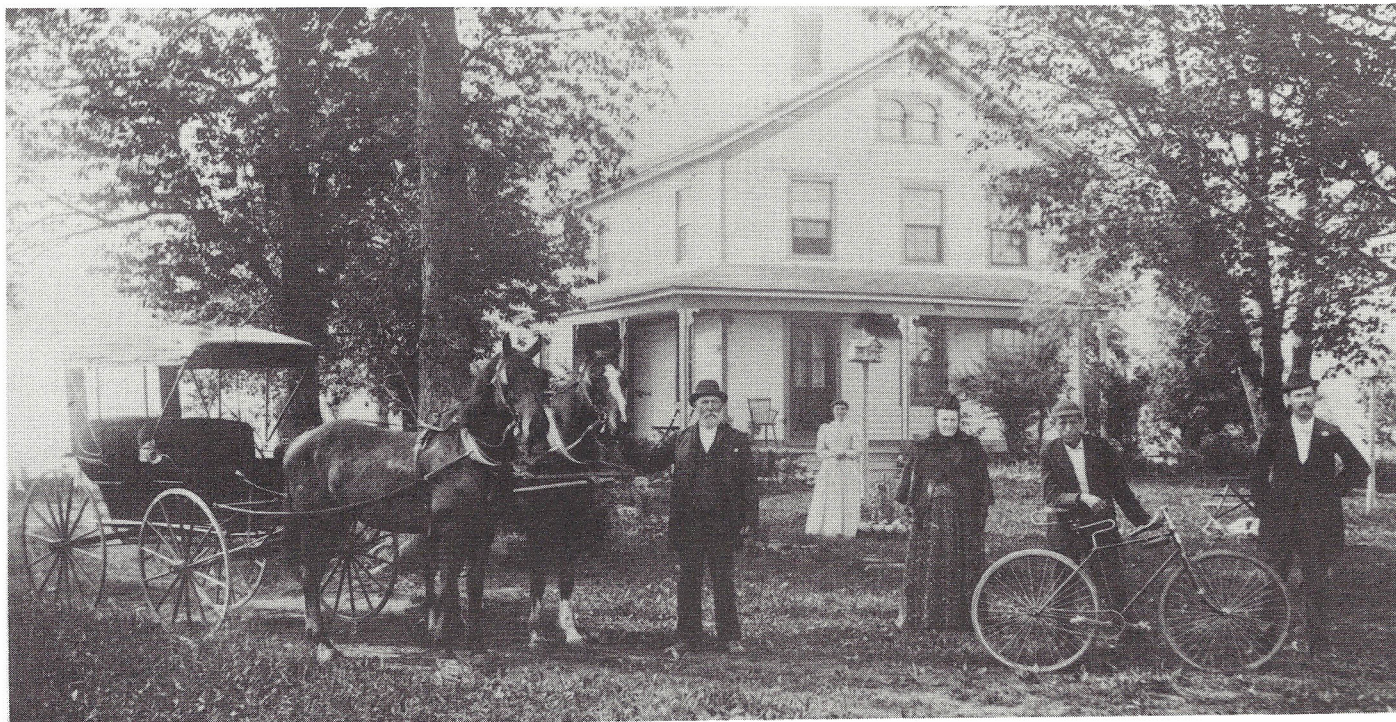
Members of the Kellogg family gathered on their front lawn, ca 1895